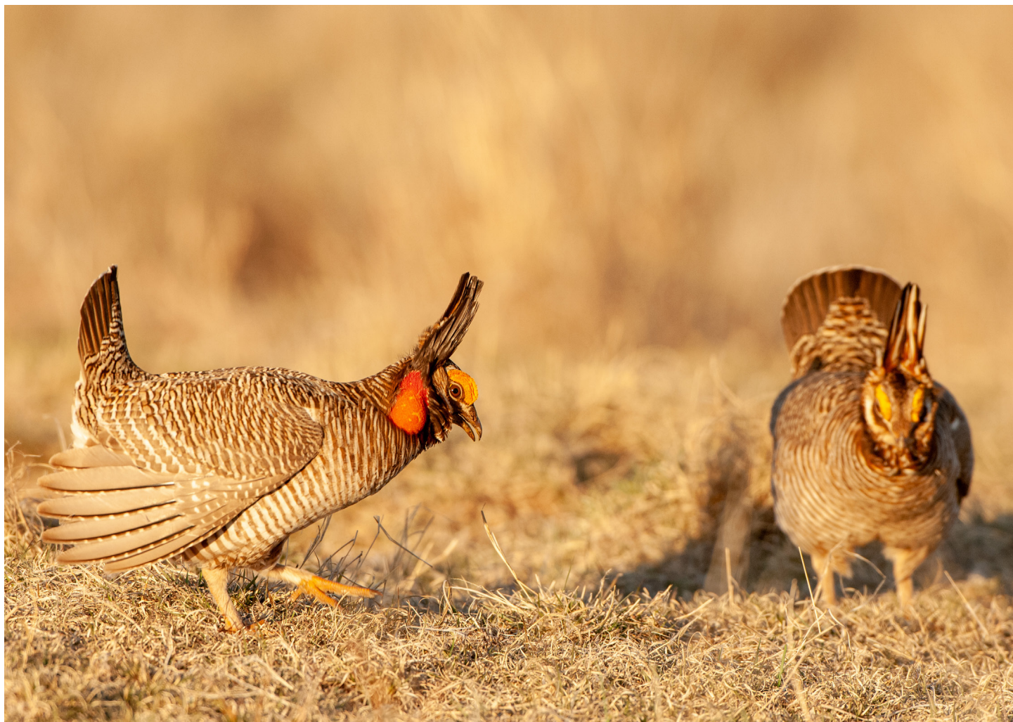
Lesser prairie chicken

The grants were awarded through the Southern Plains Grasslands Program with individual contributions provided by the USDA's Natural Resources Conservation Service, the U.S. Fish and Wildlife Service, Burger King, Cargill and Sysco with additional support from Walmart Foundation.